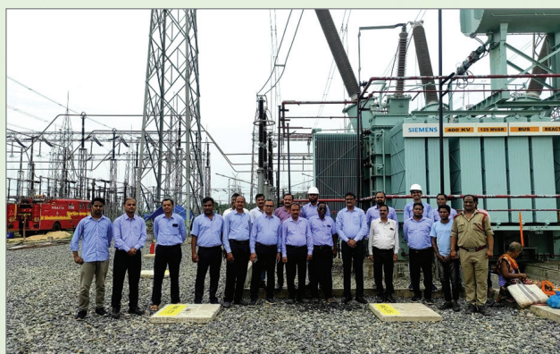
Reactor New Duburi