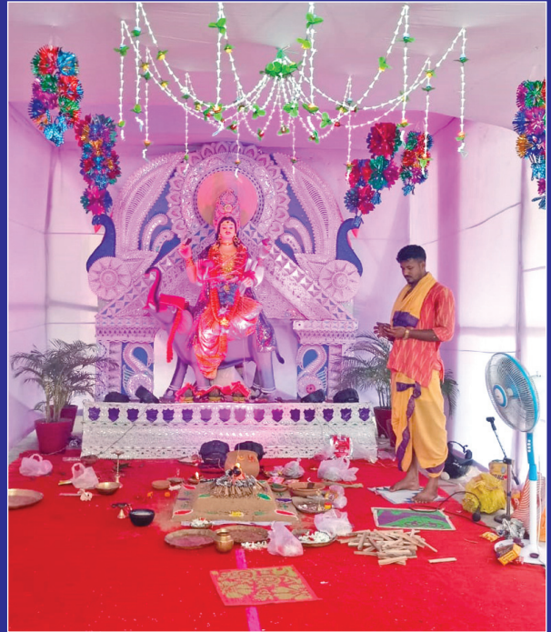
Biswakarma Puja at Hqrs Office