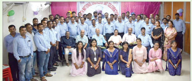
Engineers' Day Celebration at Southern Zone