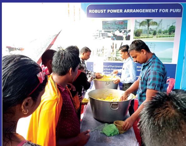
Free Health Camp and Food distribution at Rathayatra