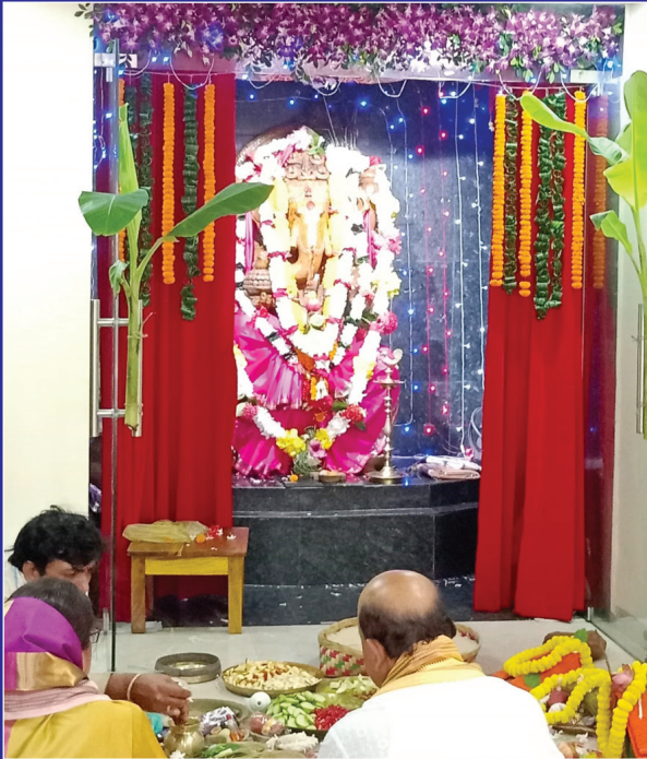
Ganesh Puja Celebration at Hqrs Office