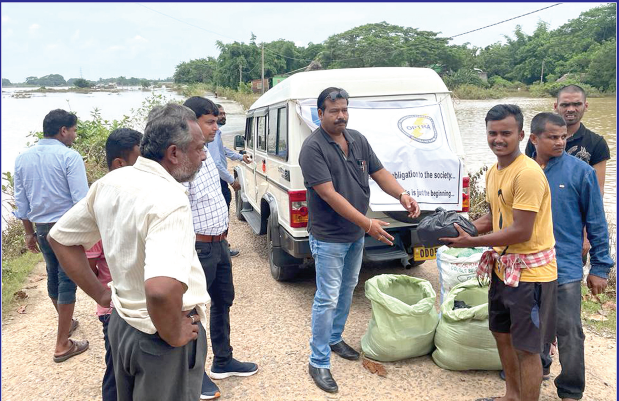
Distribution of relief during recent flood by OPTRA members